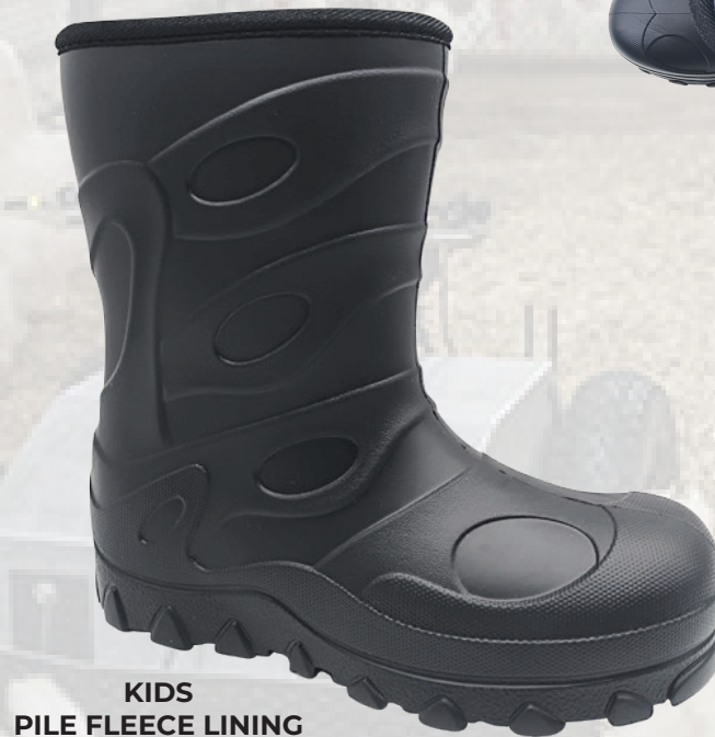
KIDS PILE FLEECE LINING